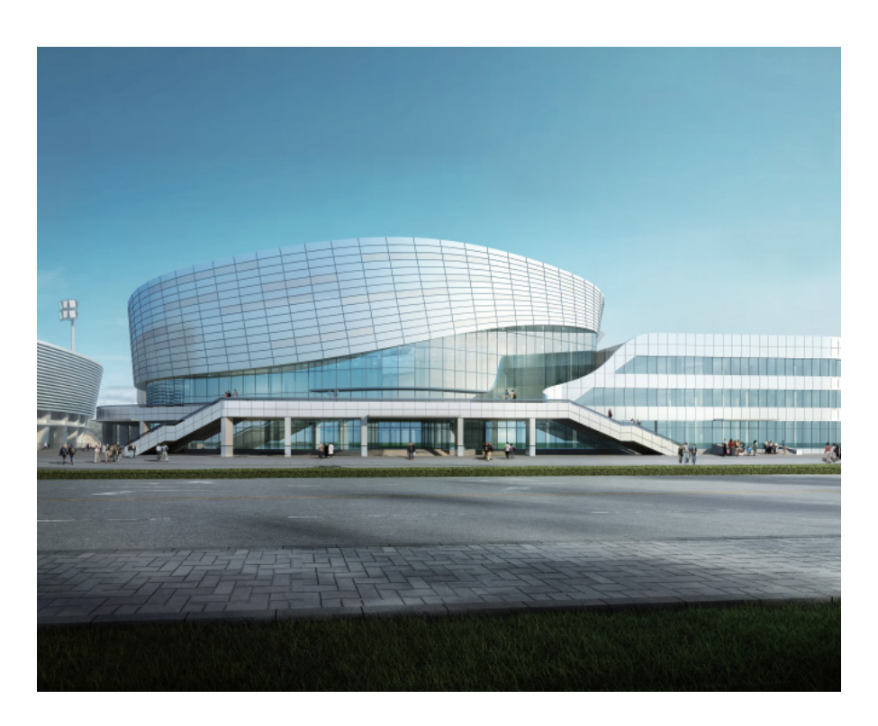
Xiaoshan Sports Centre Gymnasium